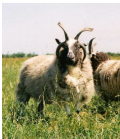
Windy Acres Dionne