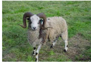
Magic Moon Saffron